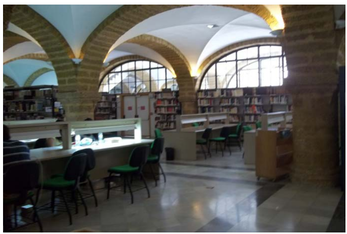
Main section of the library, Universidad de Cádiz