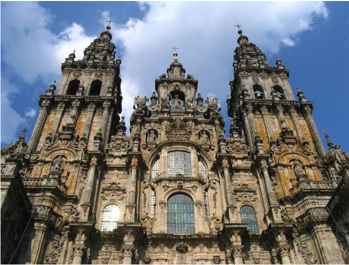
THE CATHEDRAL OF SANTIAGO

Students' independent artistic exploration, research, and investigation will take them to various possible venues around Santiago, including city archives, libraries, museums, local pilgrims' hostels, and the Pilgrim's Office of the Cathedral of Santiago.