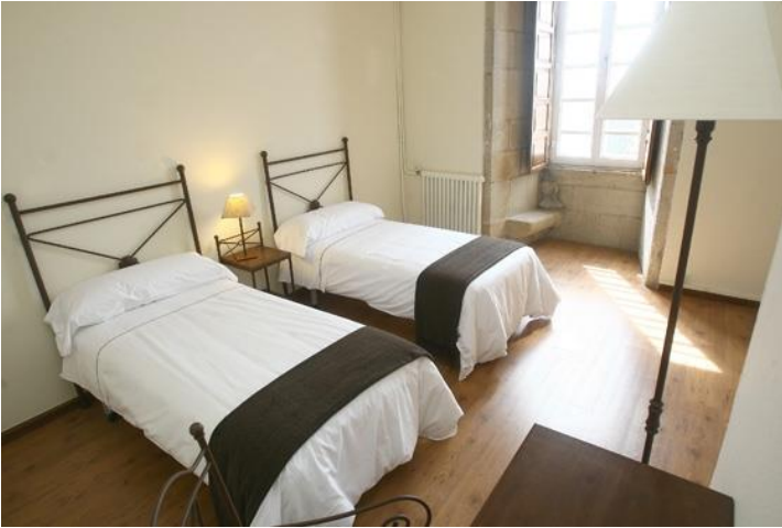
SAMPLE ROOM IN THE SAN MARTÍN PINARIO

Students will be stay in single rooms in the San Martín Pinario during their time in Santiago de Compostela. Along the Camino, they will stay in hostels with other pilgrims. In both instances, laundry will be hand-washed by each student at the hotel (or at a local Laundromat), so be sure to pack lightweight and quick-drying clothing!