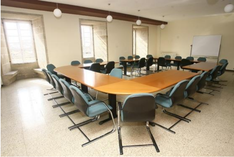
A MEETING ROOM IN THE SAN MARTÍN PINARIO