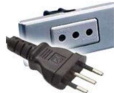
Type L: This socket also works with plug C