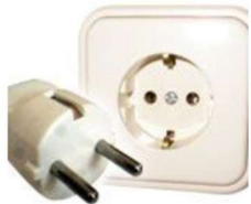
Type F: This socket also works with plug C and E